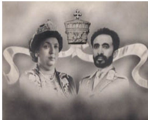
Their Imperial Majesties. Emperor Haile Selassie I & Empress Menen I.